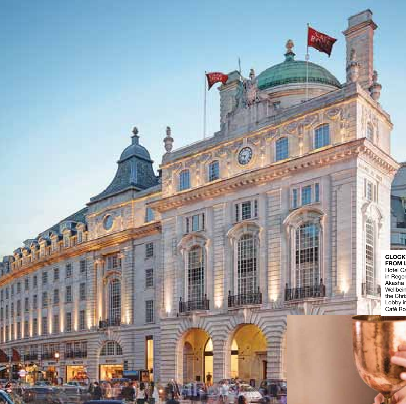
CLOCKWISE FROM LEFT Hotel Café Royal in Regent Street; Akasha Holistic Wellbeing Centre; the Christmas Lobby inside Hotel Café Royal